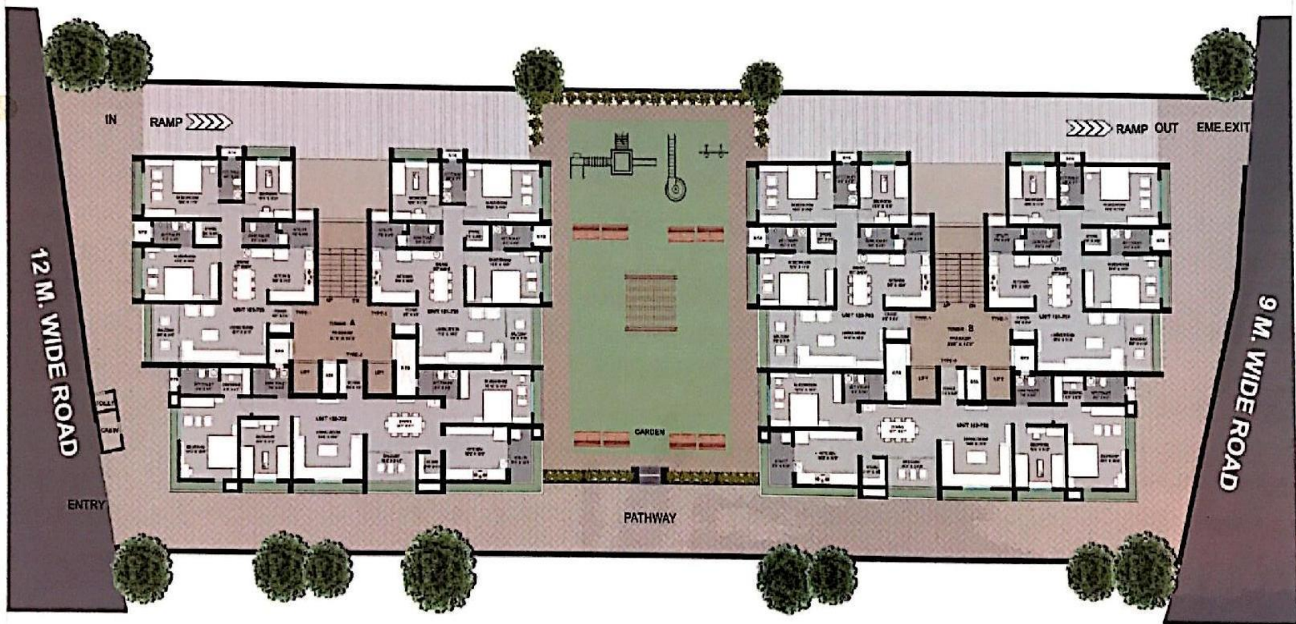
TYPICAL FLOOR LAYOUT PLAN