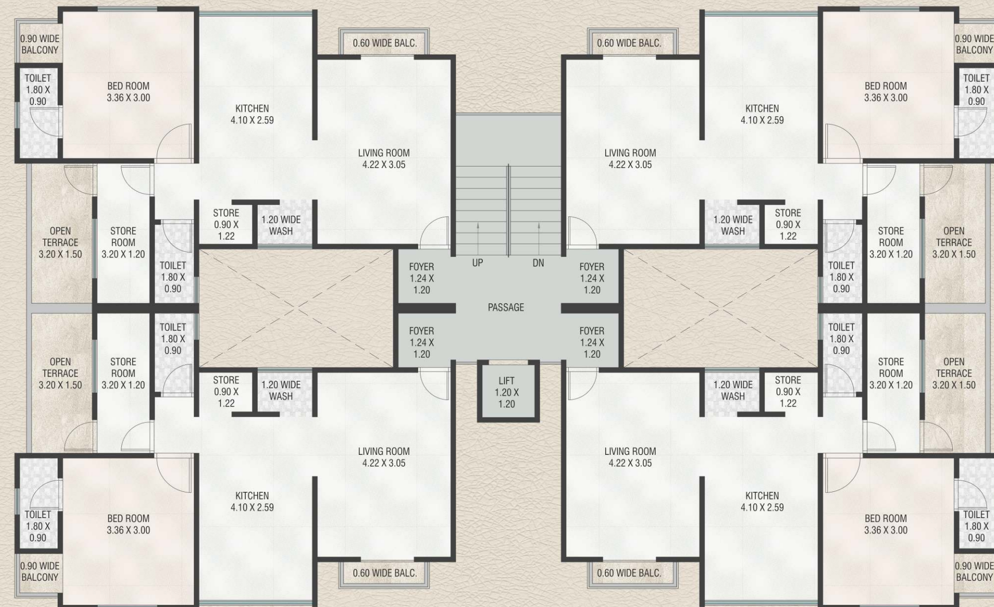
4th Floor Plan