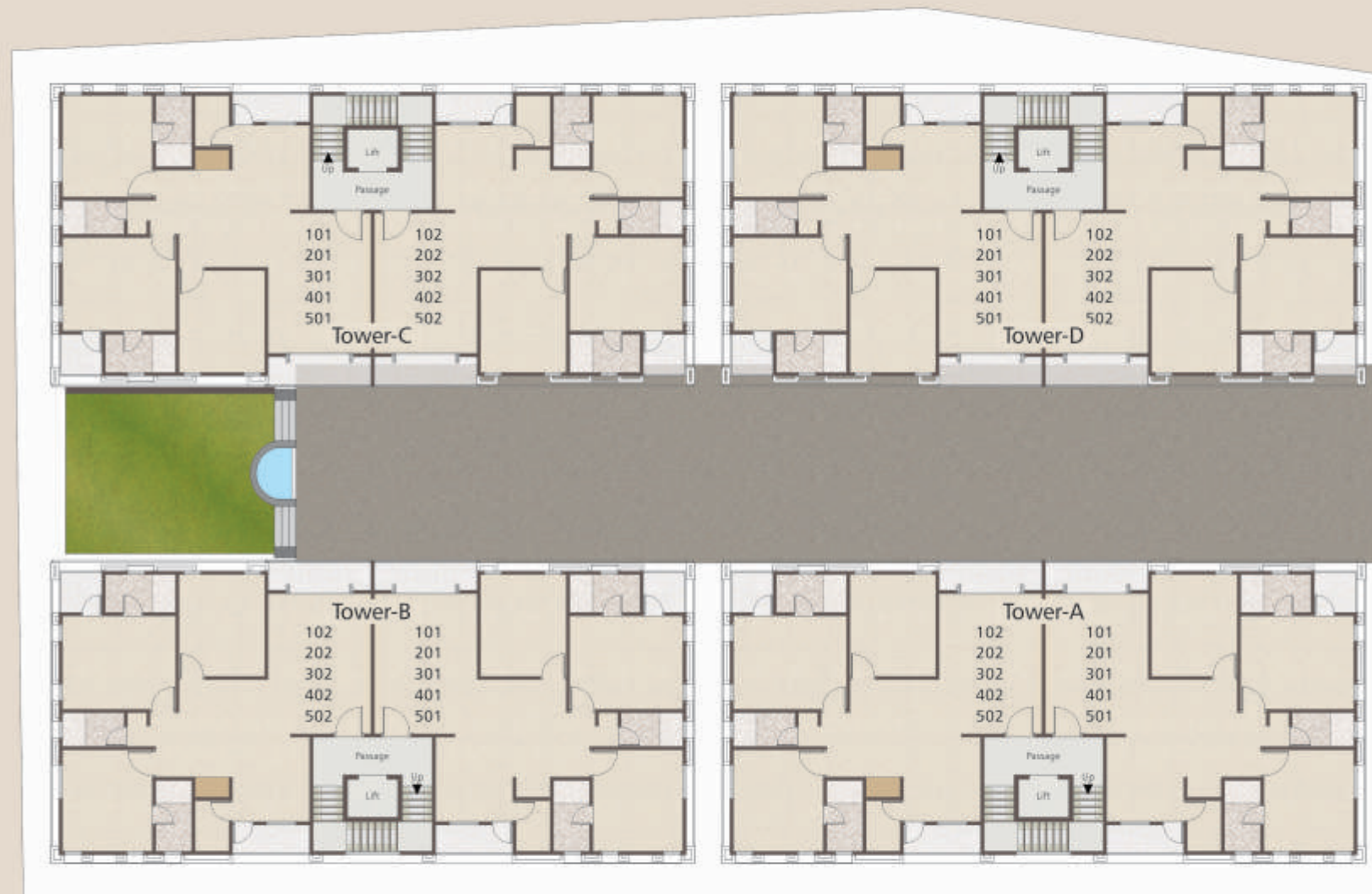
Tower Layout Plan