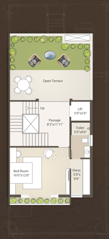
( SECOND FLOOR )