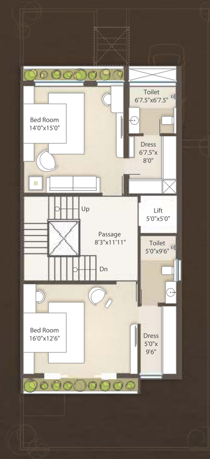
( FIRST FLOOR )