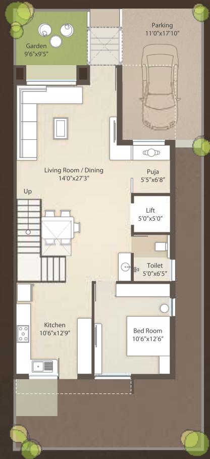
( GROUND FLOOR )