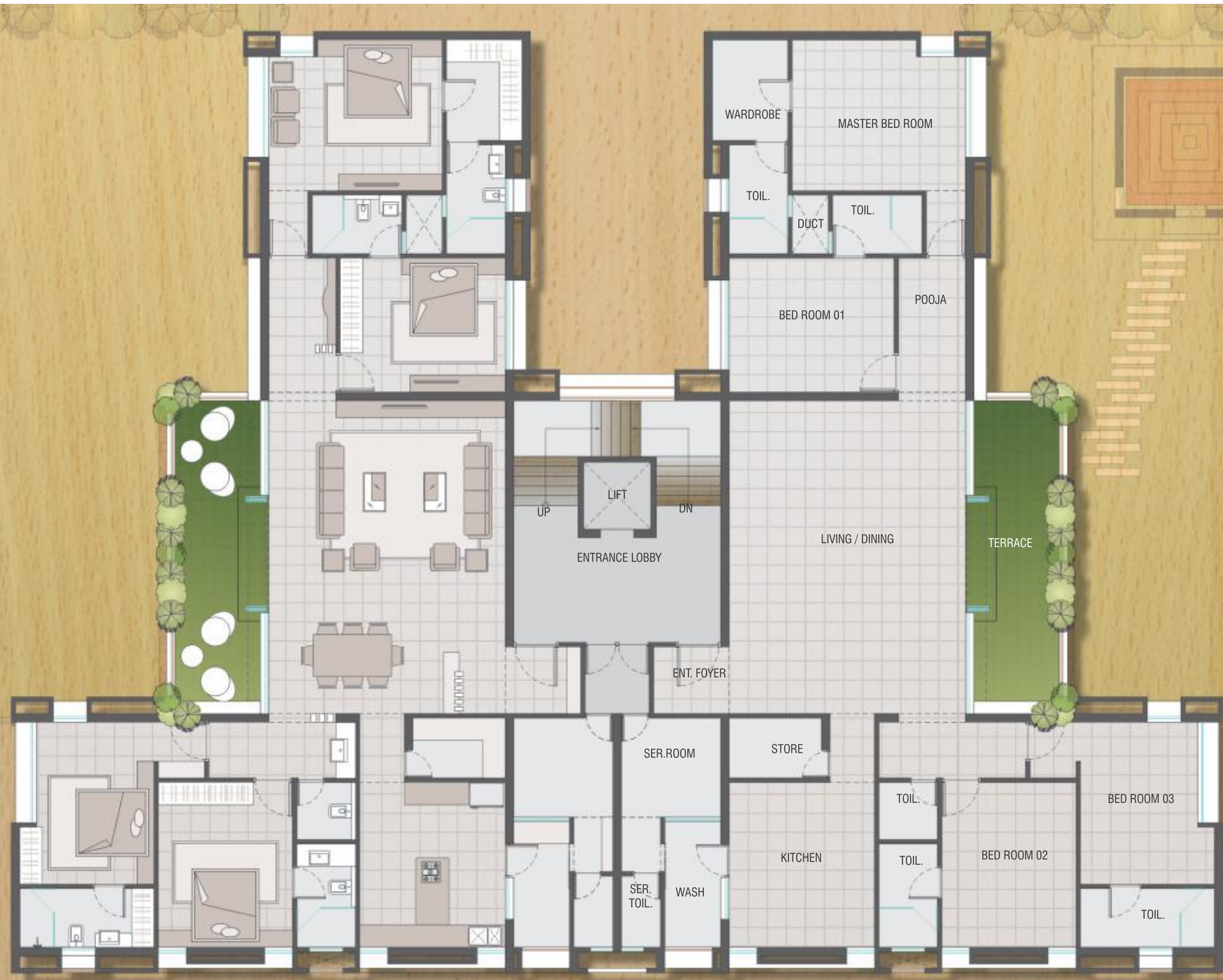
Typical Floor Plan (2 nd to 5 th Floor)