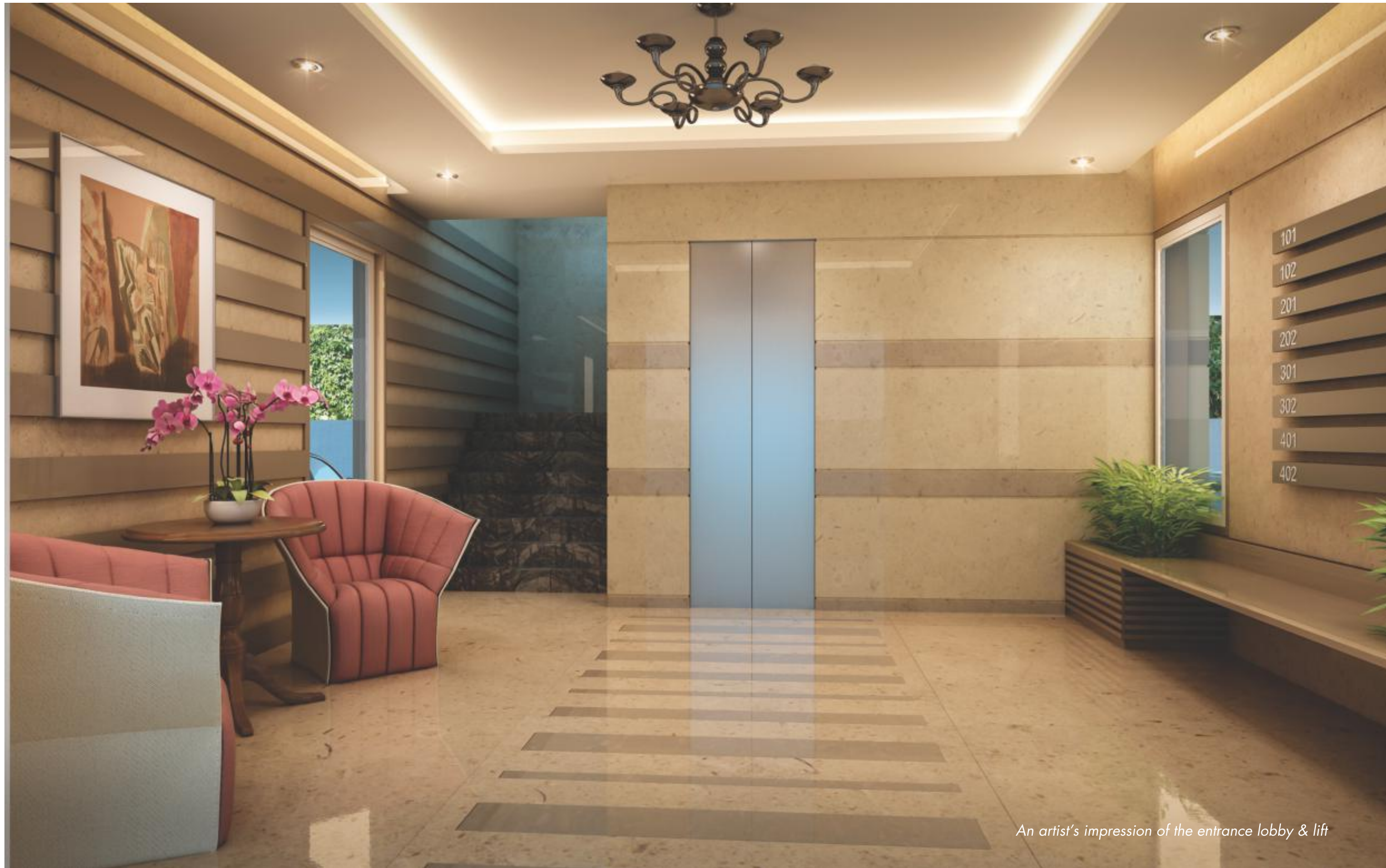
An artist's impression of the entrance lobby & lift