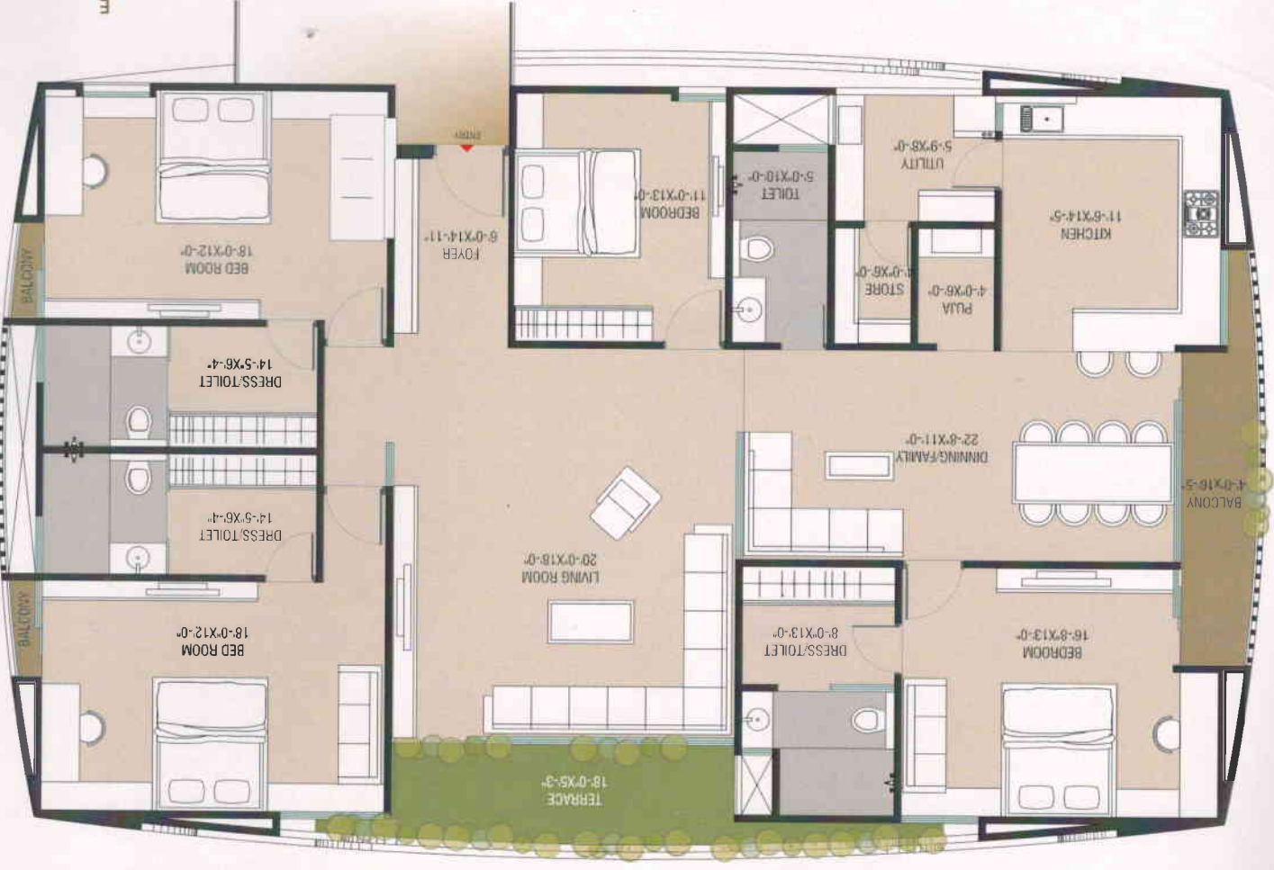
typical floor plan