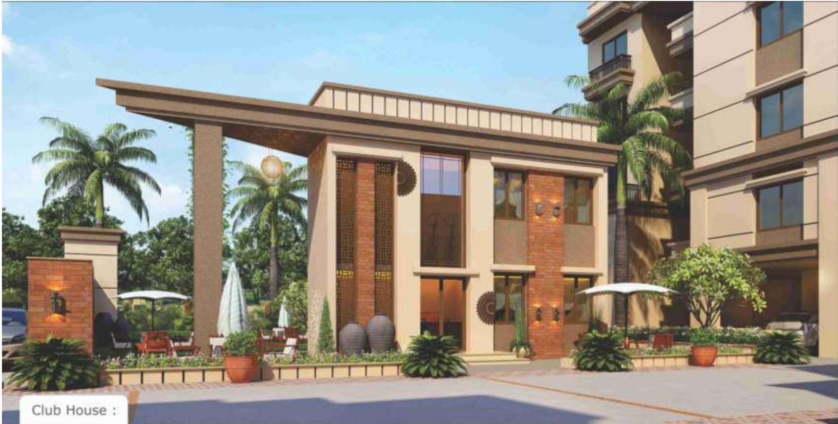
Club House :