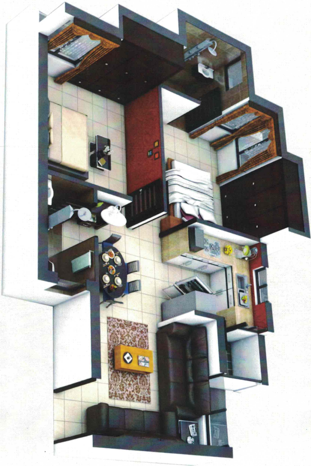
2 BHK SECTION PLAN