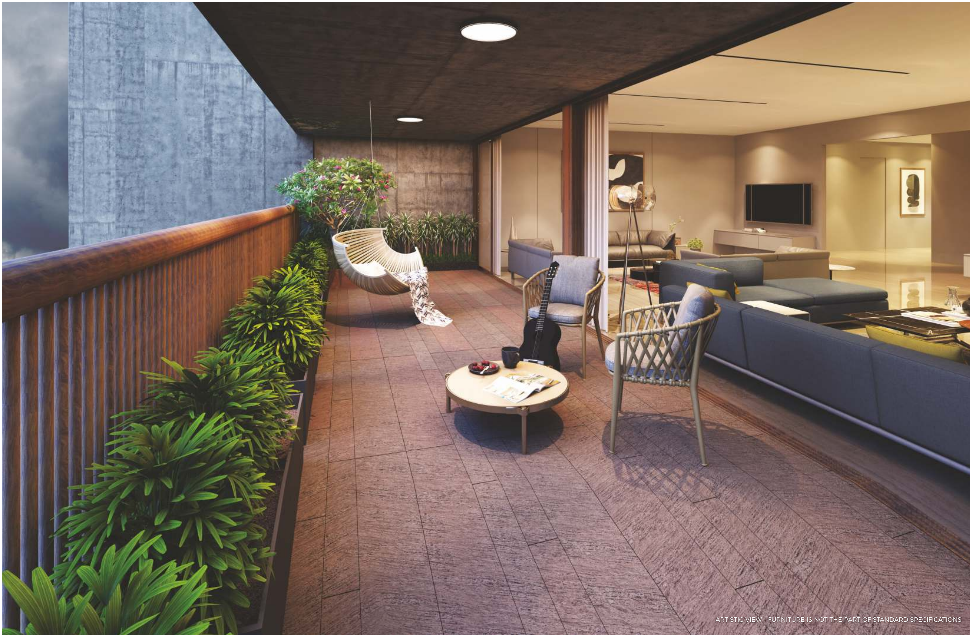
ARTISTIC VIEW - FURNITURE IS NOT THE PART OF STANDARD SPECIFICATIONS