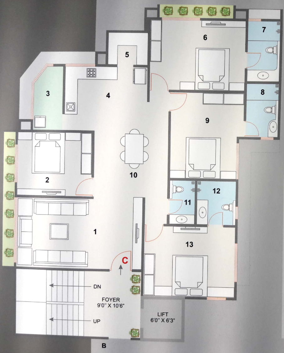
AREA TABLE :