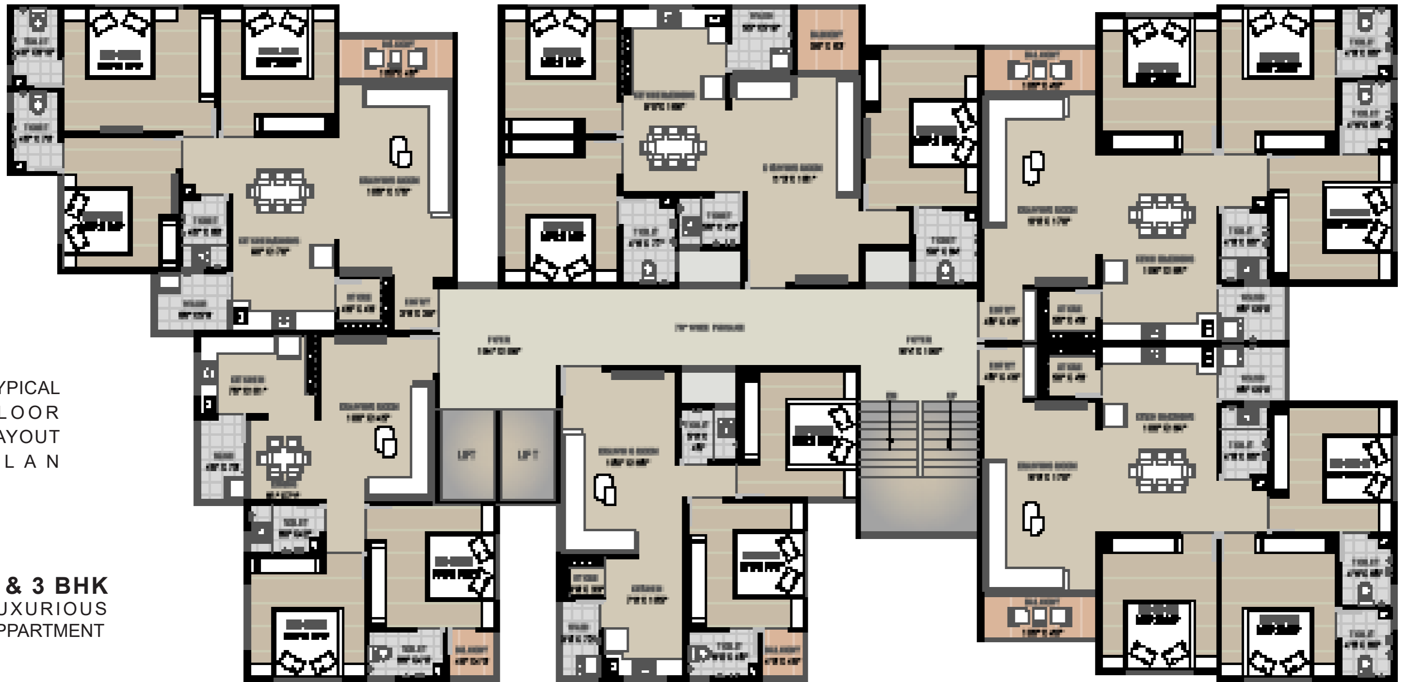
TYPICAL FLOOR LAYOUT PLAN