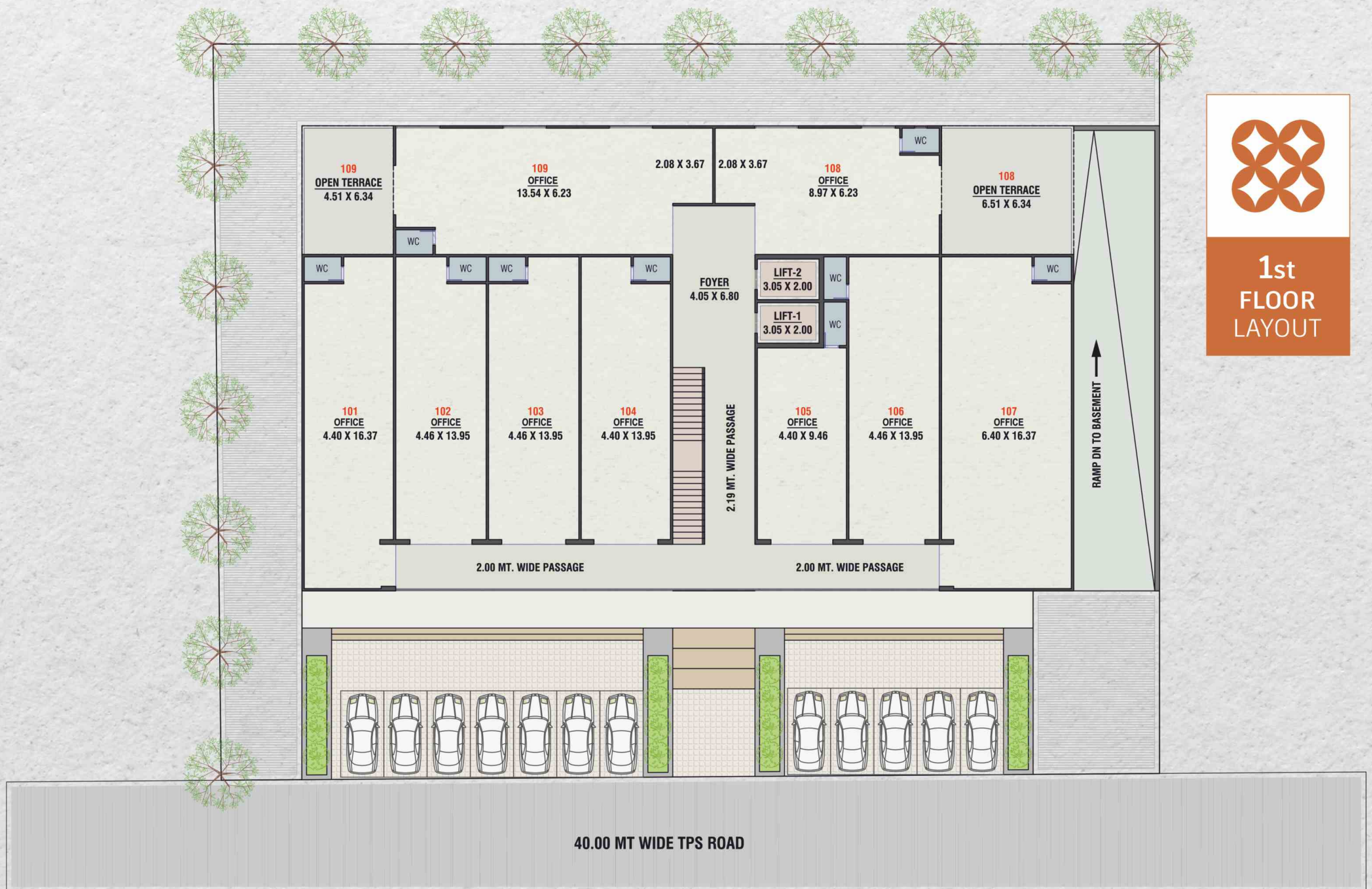
1st FLOOR LAYOUT