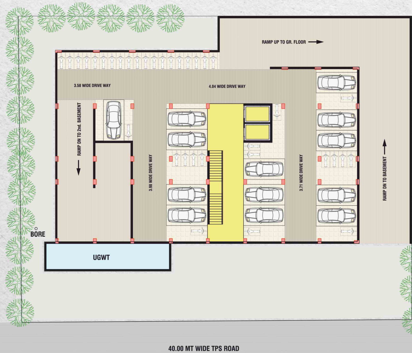
1 st BASEMENT LAYOUT