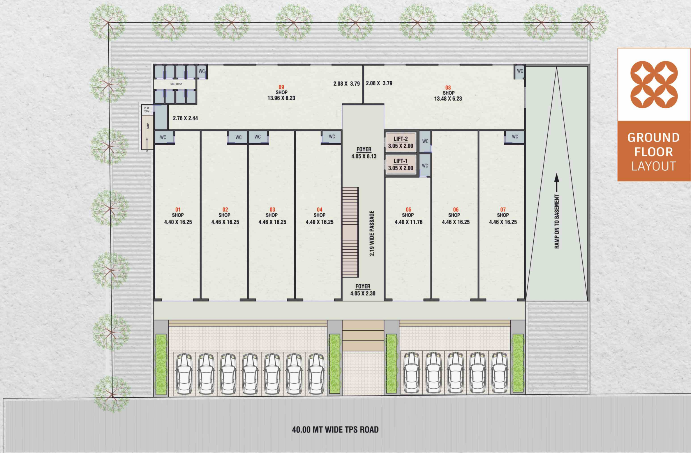
GROUND FLOOR LAYOUT