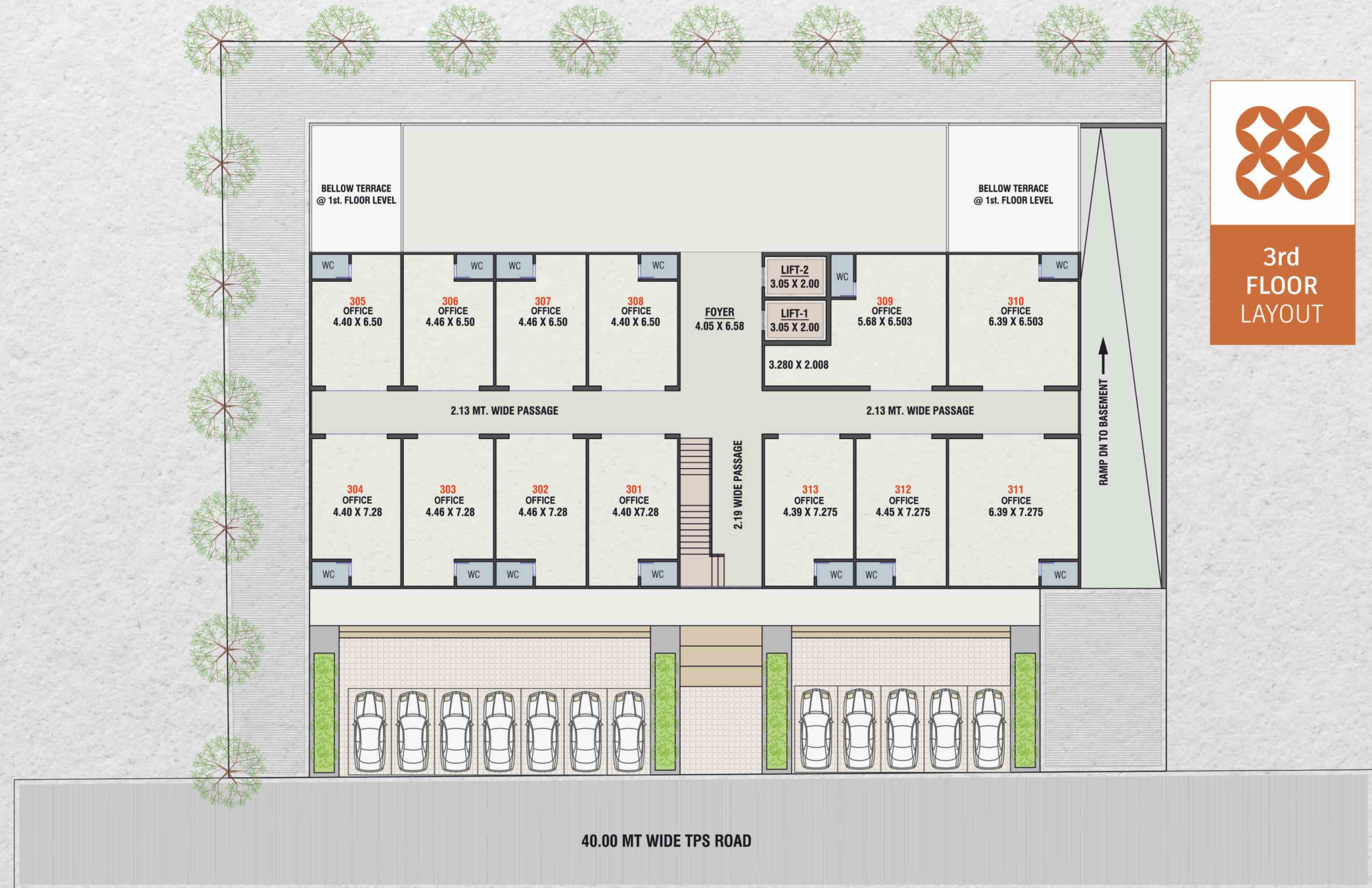
3rd FLOOR LAYOUT