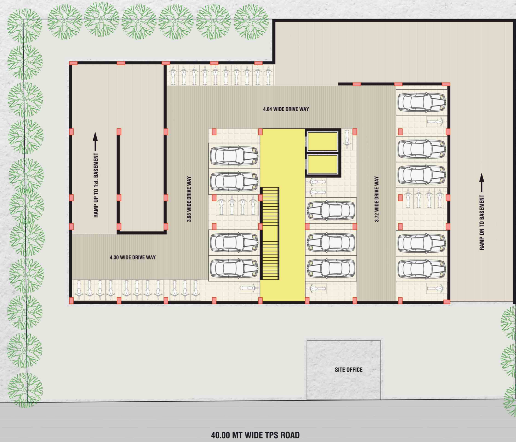
2nd BASEMENT LAYOUT