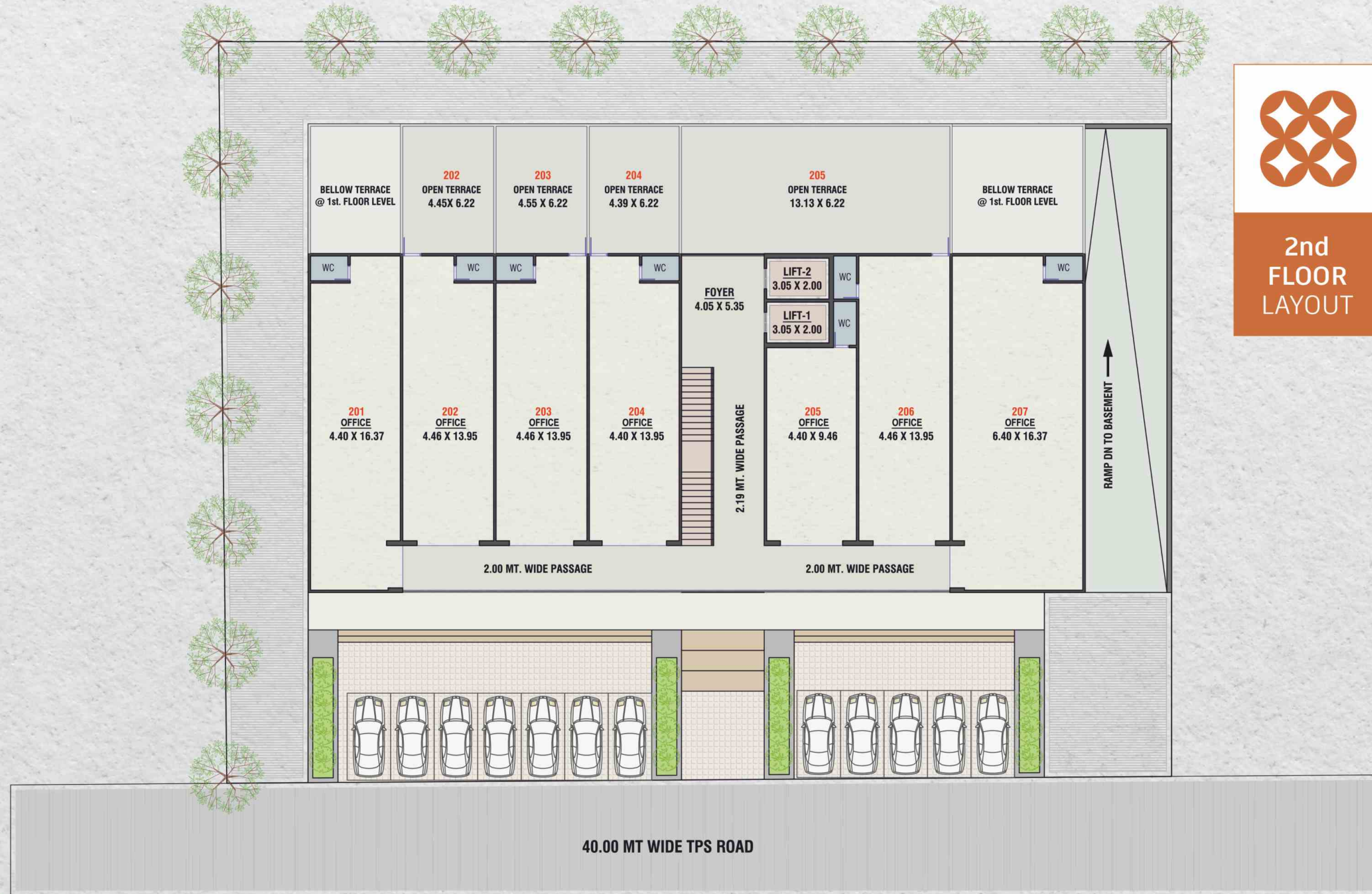
2nd FLOOR LAYOUT