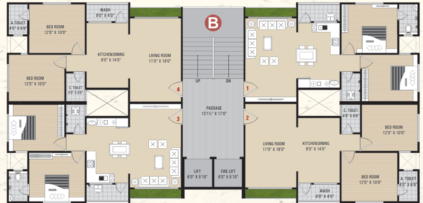
B Building Typical Floor Plan (1st to 14th Floor)