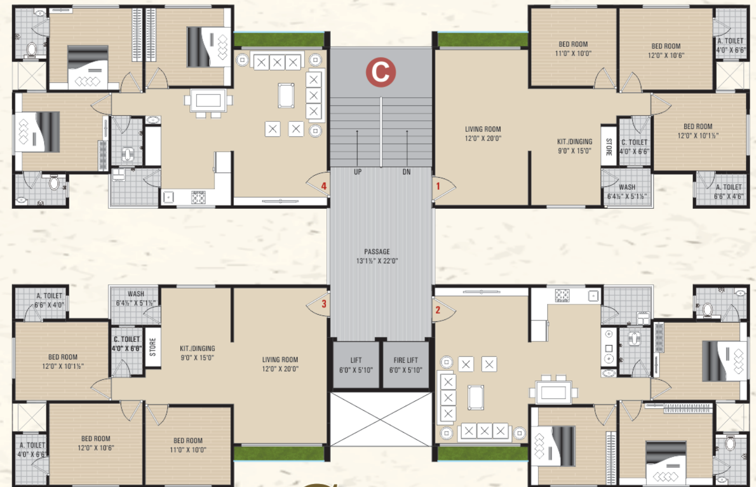
C Building Typical Floor Plan (1st to 13th Floor)