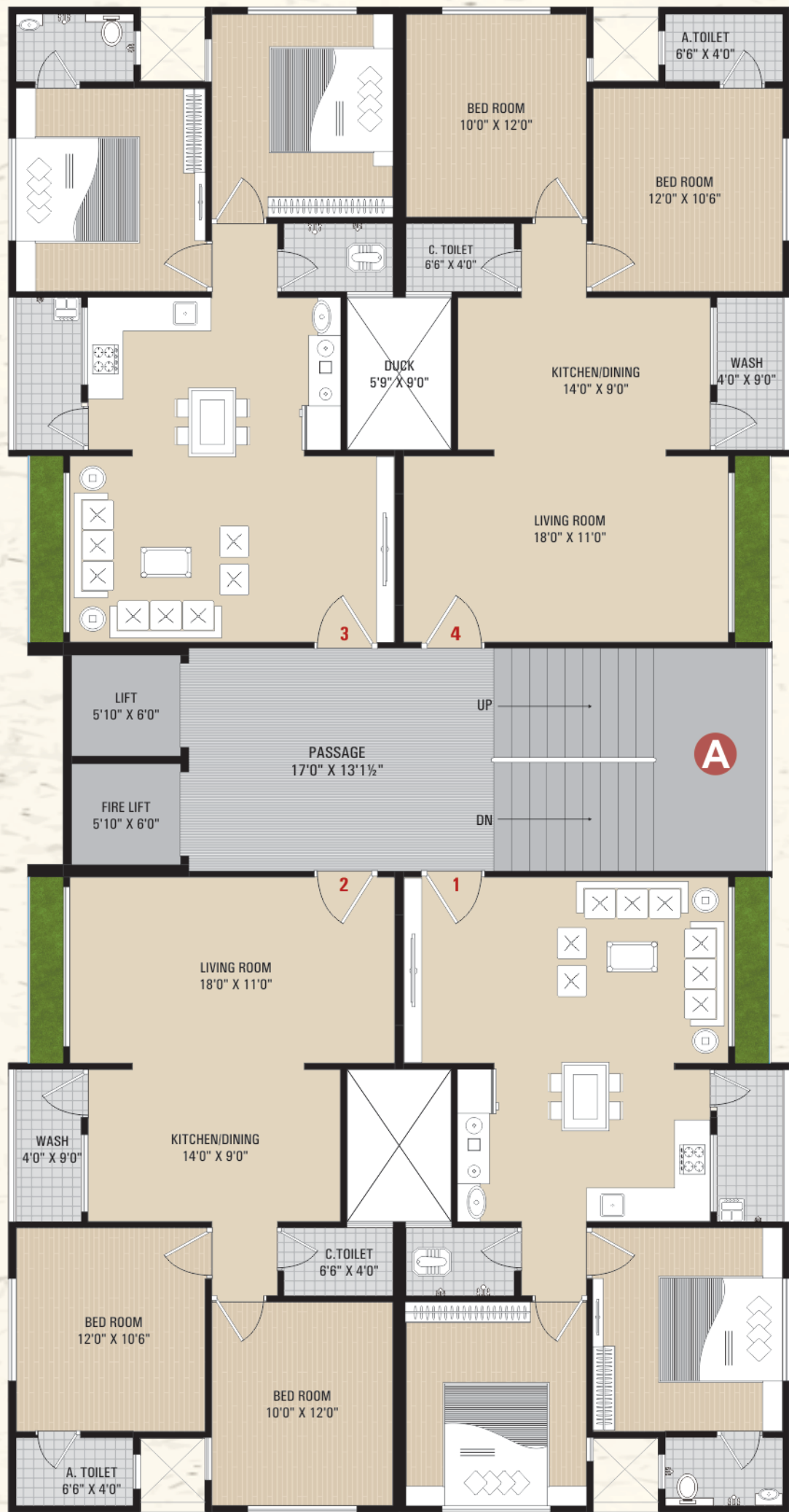
A Building Typical Floor Plan (1st to 14th Floor)