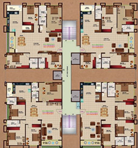
FLOOR PLAN C TOWER 4 BHK