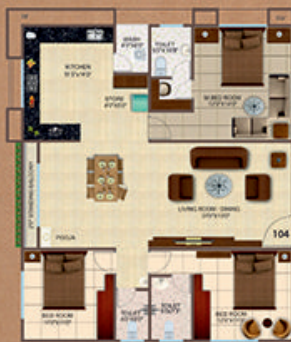
FLOOR PLAN A, B & D TOWER 3 BHK