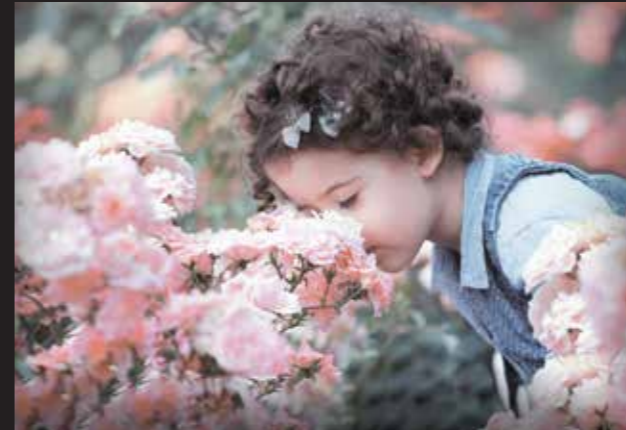
LANDSCAPED SKY GARDEN

INDULGE WITH THE STARS, PARTY WITH THE MOON