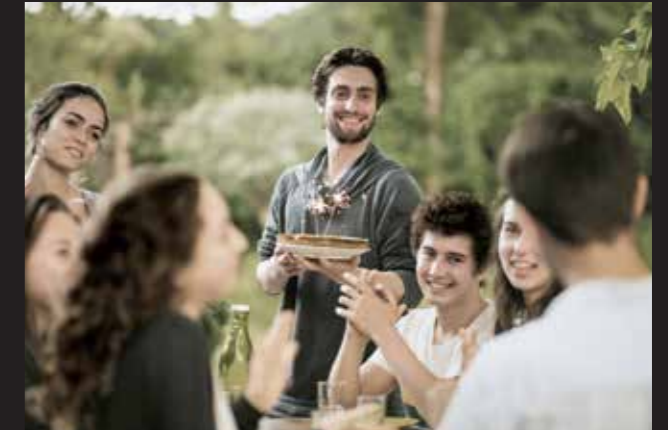
ROOFTOP PARTY AREA