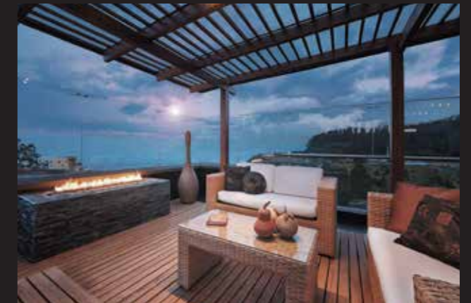
PERGOLAS WITH BARBEQUE CORNER

LET LIFE BEGIN WITH STATE-OF-THE-ART FEATURES