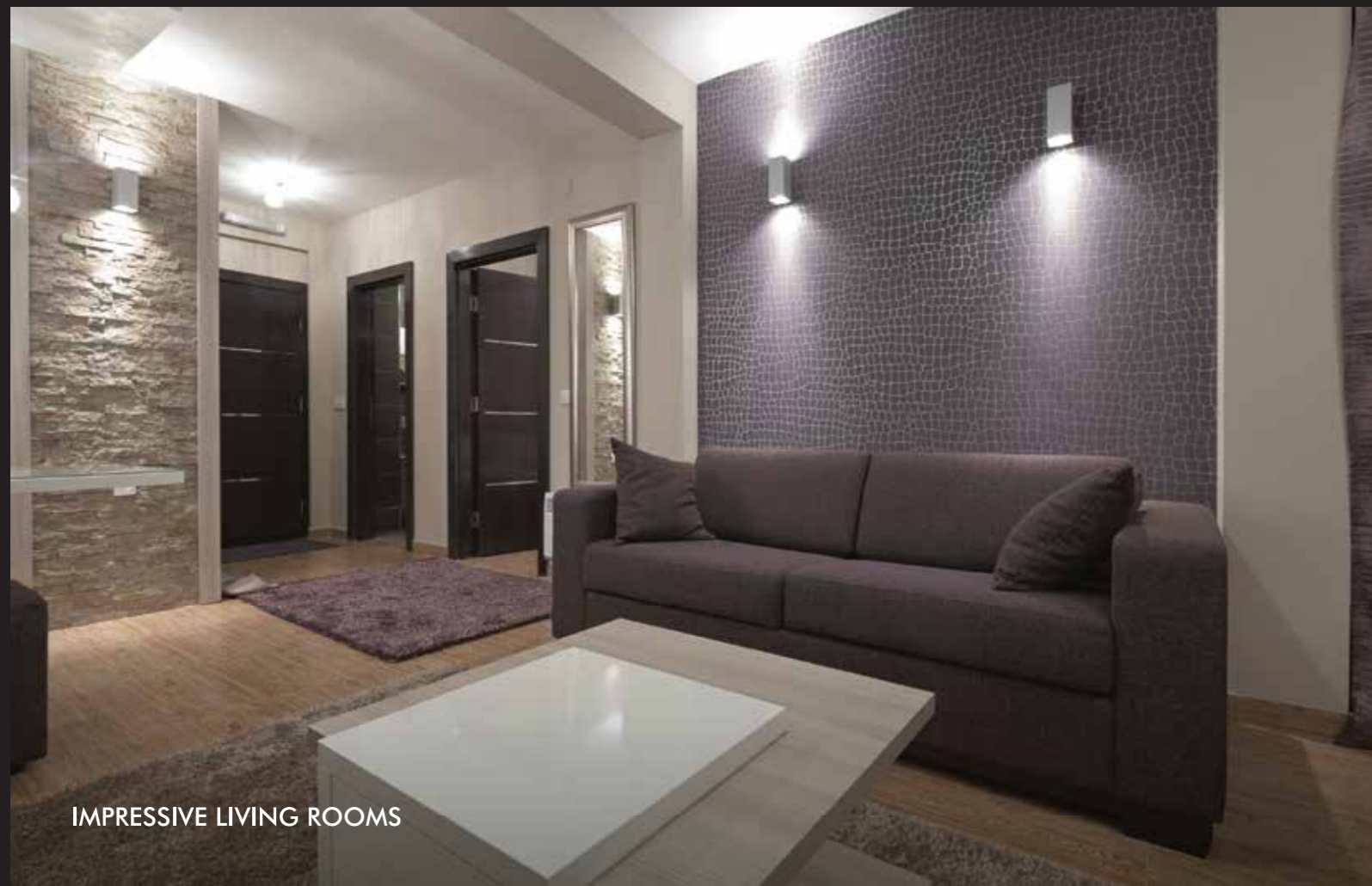
IMPRESSIVE LIVING ROOMS