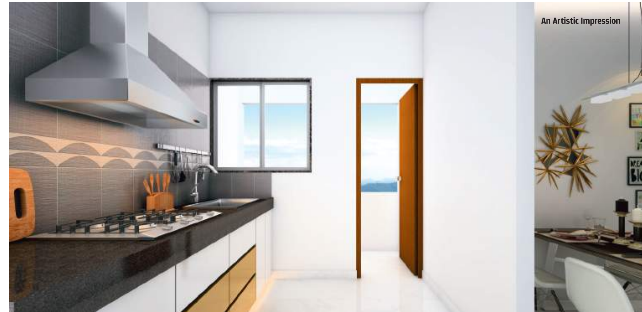
An Artistic Impression