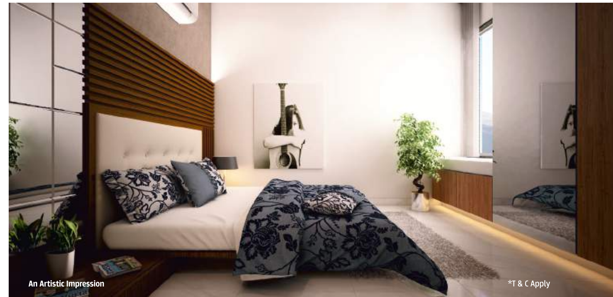
An Artistic Impression