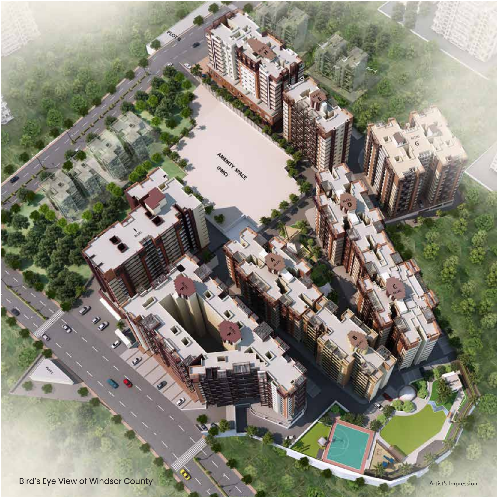
Bird's Eye View of Windsor County